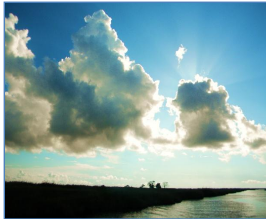
MOUSE HARBOR DITCH